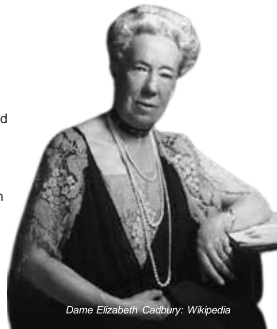
Dame Elizabeth Cadbury: Wikipedia

Elizabeth Cadbury was a social reformer and philanthropist who made significant contributions to the improvement of the living and working conditions of people in Birmingham. She was married to George Cadbury, creator of chocolate company Cadbury's. Elizabeth was deeply committed to social justice and worked tirelessly to promote education, healthcare, and community development initiatives. Dame Elizabeth founded the Birmingham Women's Settlement, which provided education and support to disadvantaged women, and also served on the boards of numerous organisations, including the National Society for the Prevention of Cruelty to Children.