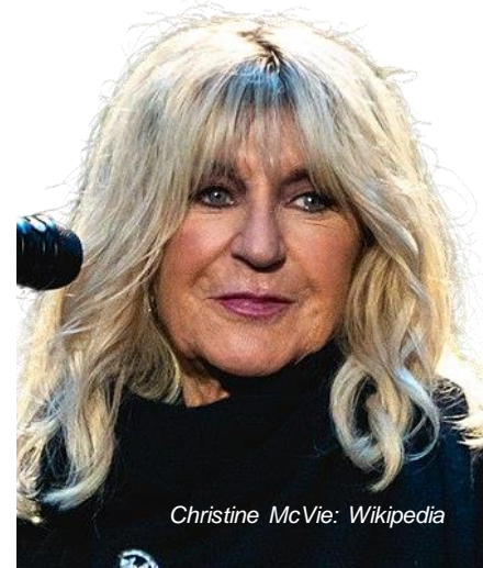
Christine McVie

Multi-award-winning actress, Dame Julie Walters, was born in Edgbaston but grew up in Bearwood, Smethwick in Sandwell. At the age of 18, she trained as a student nurse at the Queen Elizabeth Hospital in Birmingham but left to study acting at the Manchester School of Theatre. Julie is known for her roles in Educating Rita and Billy Elliot as well as playing Molly Weasley in seven of the eight Harry Potter films. She is a lifelong supporter of West Bromwich Albion Football Club, having been brought up in Smethwick, and she is a patron of the domestic violence survivors' charity Women's Aid .