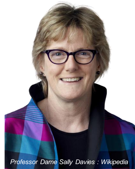
Professor Dame Sally Davies