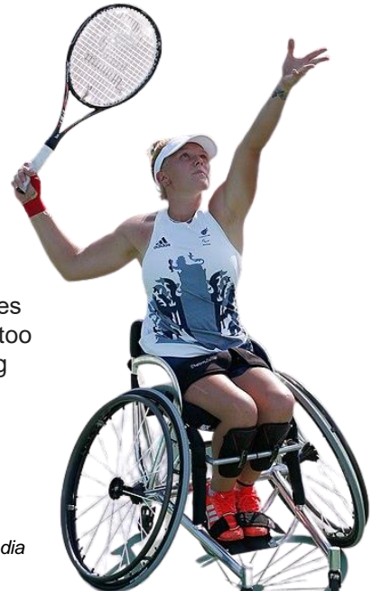
Jordanne Whiley: Wikipedia

Birmingham City and England Hall of Fame inductee, Karen Carney MBE is a sports broadcaster and former professional footballer who played as a winger and midfielder. Born in Solihull, Karen began her career at Birmingham City and has represented England at four FIFA Women's World Cups. At the time of her retirement she was the second most capped England player with 144 appearances. Karen Carney has also co-created "the Second Half"; a programme supporting women footballers in their careers post-football.