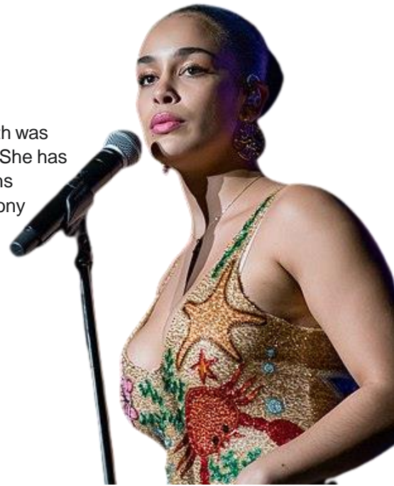
Jorja Smith